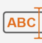
Find and Replace