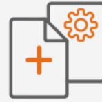
Sheet View Manager