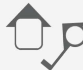
Section and Elevation Creation