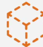
Scope Box Manager