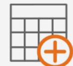
Create Table in Revit from Excel