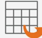
Extract & Update from Revit to Excel