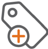
Automate Tagging with Tag Select