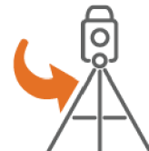
Export CSV to Total Station