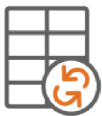
Sync Fab Parameters