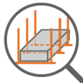
View Hanger Arrays with Configurable Spacing