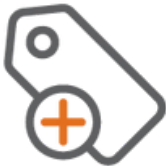
Automate Tagging with Tag Select