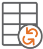
Sync Fab Parameters